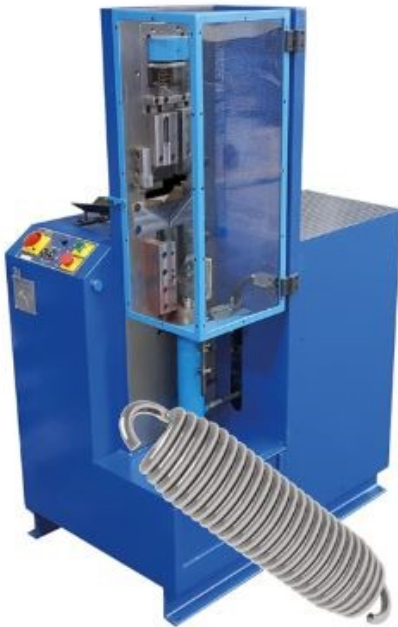
MPK-20 includes a standard set of tooling