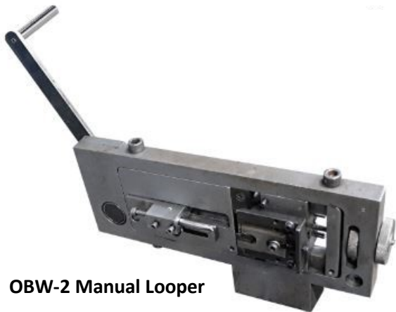
OBW-2 Manual Looper