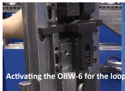
Activating the OBW-6 for the loop