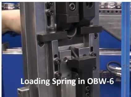
Loading Spring in OBW-6