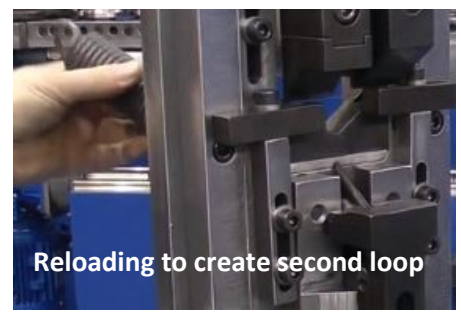
Reloading to create second loop

Watch OBW-6 Video: https://vimeo.com/145616805