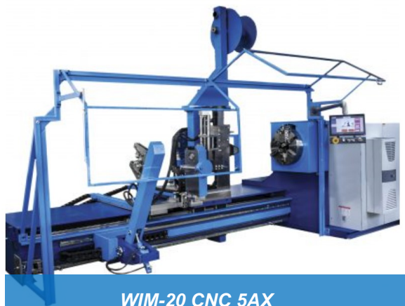
WIM-20 CNC 5AX

Depending on your needs, there is a WIM-CNC machine for you. From compression and extension springs to torsion springs and different wire forms. Machines range from 2 axis up to 5 controlled axis. This gives flexibility for higher productivity, production of different 2D wire forms and bends on the spring legs.